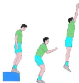
Figure 2 Depth Jumps were completed off a ~ 24 inch box. 5 sets of 20 reps were completed. Depth Jumps consist of stepping off a box and immediately going into a vertical jump upon hitting the ground 4 .

Davies et al. had 11 trained athletes (7 female, 4 male) complete 2 plyometric training sessions (Depth Jumps - See Figure 2 for protocol), separated from each other by 1 week 4 . Following each session, athletes wore complete lower body CG or regular clothing for 48 hours. After 2 days of wearing each clothing type, Davies et al. measured sprint speed (5, 10, 20m), 5-0-5 agility testing, countermovement jump height and perceived muscle soreness. When comparing post workout scores to those obtained prior to 1st session (ie- baseline scores), regular clothing proved just as effective as CG . In other words, CG did not enhance the body’s ability to recover from the plyometric workout. One partial exception to this rule was observed for muscle soreness . Significant increases were noted 48 hours post workout while wearing regular clothing. This effect was not observed following the CG trial. For reference, all baseline measurements were obtained 1 week prior to the first plyometric session.