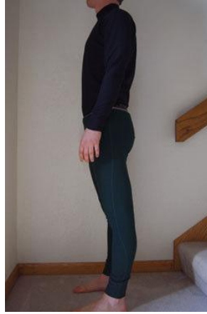
Figure 1 An individual wearing compression gear

To my knowledge, Kraemer et al. was the first research group to study the use of CG in healthy individuals (ie- no clinical orthopedic injuries such as sprains, etc) 2 . In the study, they induced muscle damage in 20 untrained females by having them complete 2 sets of 50 arm curls . Upon completion, 10 individuals wore a compressive sleeve over their bicep and elbow joint for 5 consecutive days. By day 3 those wearing the CG had significantly less pain, greater range of motion and enhanced recovery of muscle force vs. those in the control group.