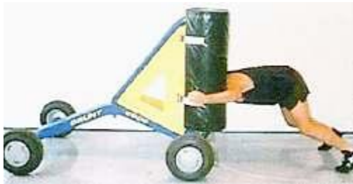
Figure 3 Power tests were completed on single man scrum machines which replicate the starting position in rugby matches.

Duffield et al. examined if CG would improve physical recovery following simulated team game (STG) activities in 14 rugby athletes 1 . The STG involved 4, 15 minute high intensity circuits which replicated movements seen during simulated team games. Sprints (5×20m sprints) and power tests (See Figure 3 ) were completed between quarters to assess the impact that CG had on physical performance. In its entirety, the training session lasted 80 minutes. Complete lower body CG was worn both during the activity as well as 15 hours afterwards. A day later, the STG was repeated to assess recovery measures. This same 2 day procedure was repeated 2 weeks later to allow all individuals to perform with and without the CG.