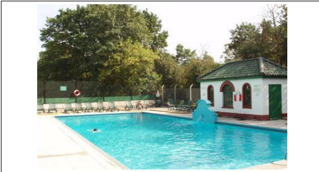
Figure 1 Jumping in a pool post workout does seem like a pretty tempting idea

One of the most popular PWRM is hydrotherapy (hydro means water). Fill a tub up with water, jump in and let the good times roll! The theory behind immersing oneself in water is that it increases hydrostatic pressure on one's body 6 . During exercise, a fluid shift occurs as oxygen and other nutrients are delivered from the circulatory system to the working muscle. Some of this blood/plasma immediately returns to the heart as would be expected. On the other hand, a portion of this fluid "pools" in the spaces surrounding muscle fibers. In the process, waste products, produced by the working muscles, are prevented from being efficiently reabsorbed.