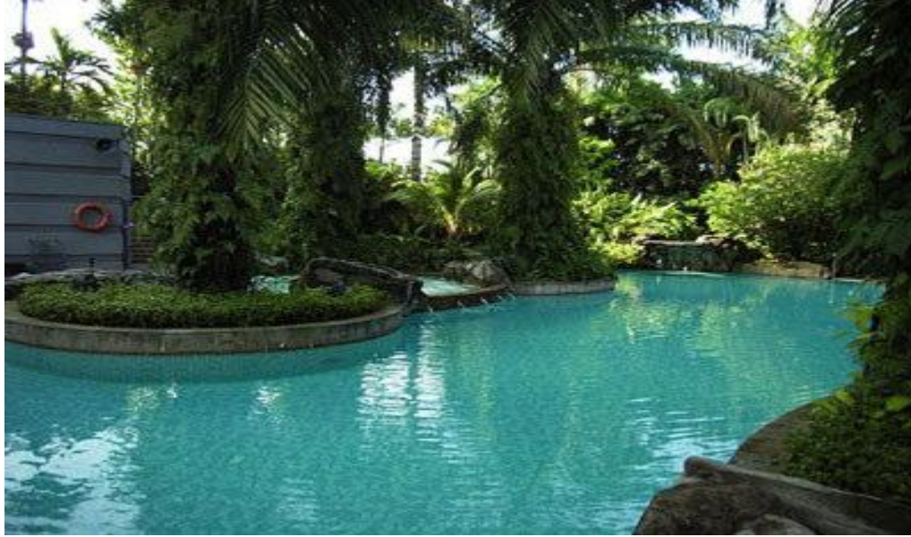
Figure 1. A quick dunk in the pool doesn't seem like too bad of an idea after an intense workout.